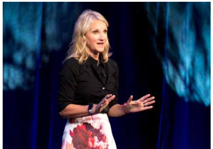
APICS 2016 Keynote Speaker Mel Robbins