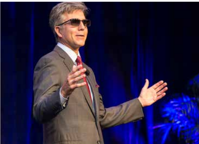
APICS 2016 Keynote Speaker Bill McDermott